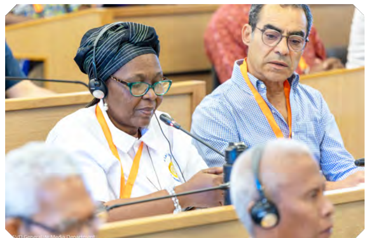
SVD Generale, Medisk Department