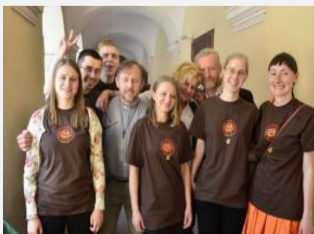
Volunteers in Poland

We are praying that more people will be interested in supporting our activities especially in our visits to rural and poor areas served by the SVDs.